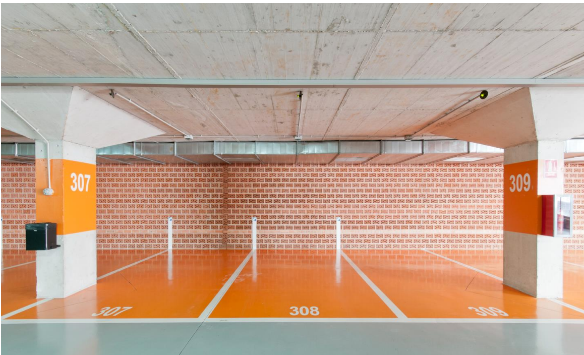
Example of underground orange parking lots which can be colored with Colanyl Orange H5GD 500.

Colanyl Orange H5GD 500 is a yellowish orange pigment preparation that closes the gap of available waterborne orange preparations allowing the customer to match bright orange shades with high performance.