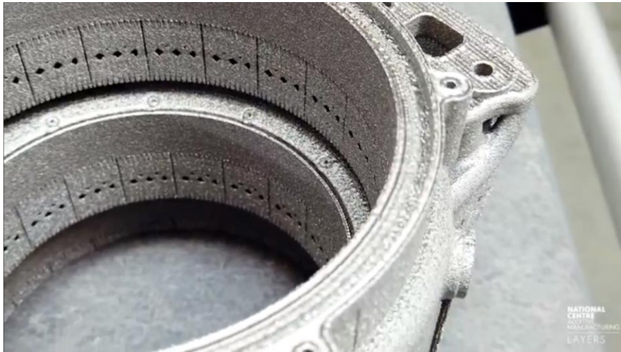
OBR part with supports, prior-to support removal.