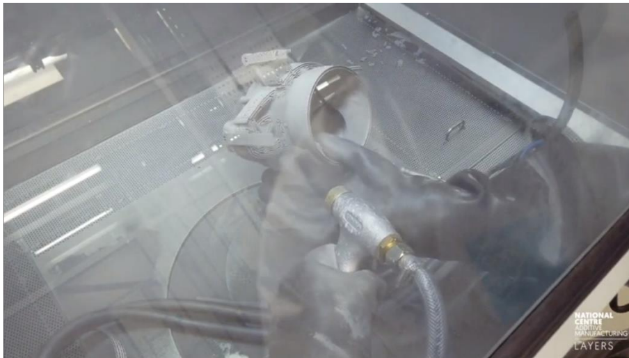
OBR part produced in Ti-6Al-4V on an Arcam EBM Q20 plus.