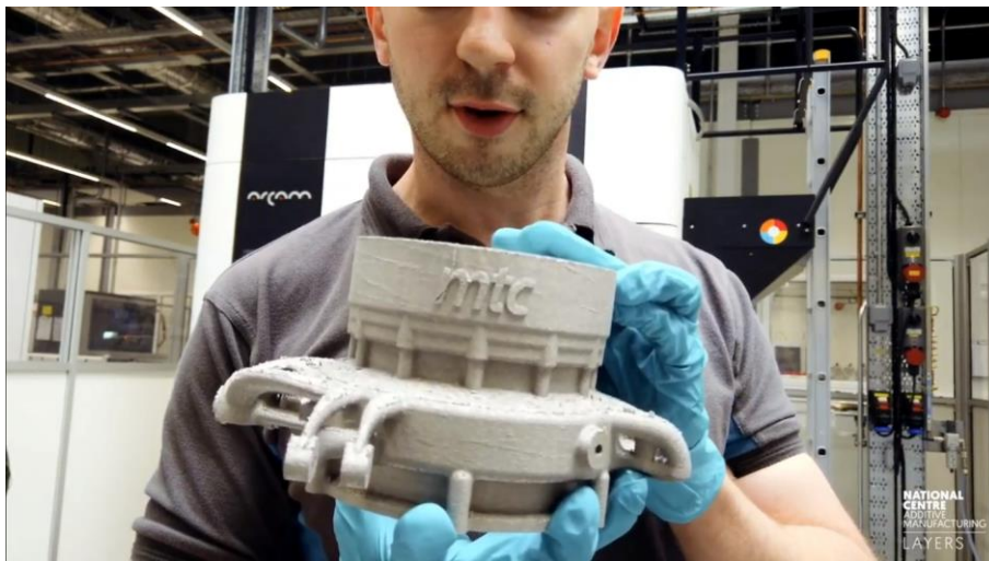
OBR part with supports removed, prior to post-processing. (Photo: National Center Additive Manufacturing, GEADPR042)

This press release and relevant photography can be downloaded from www.PressReleaseFinder.com . Alternatively for very high resolution pictures please contact Siria Nielsen ( snielsen@emg-marcom.com , +31 164 317 036).