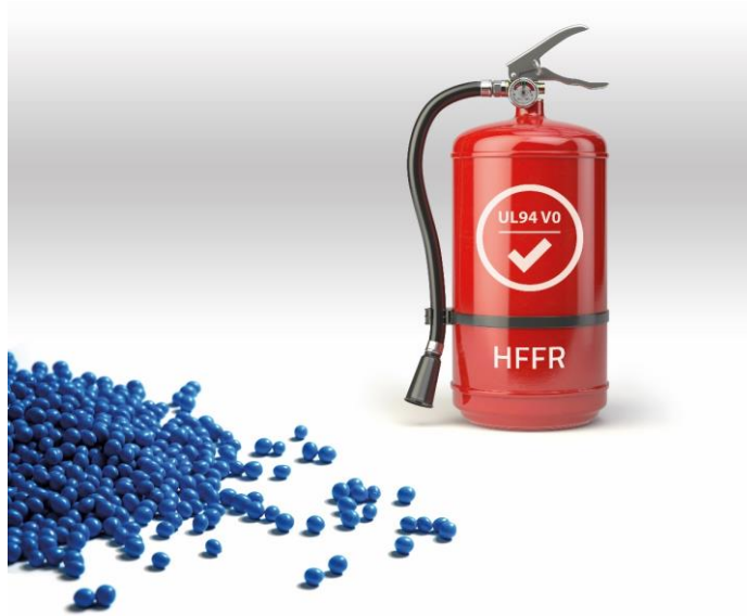
Appendix 4.