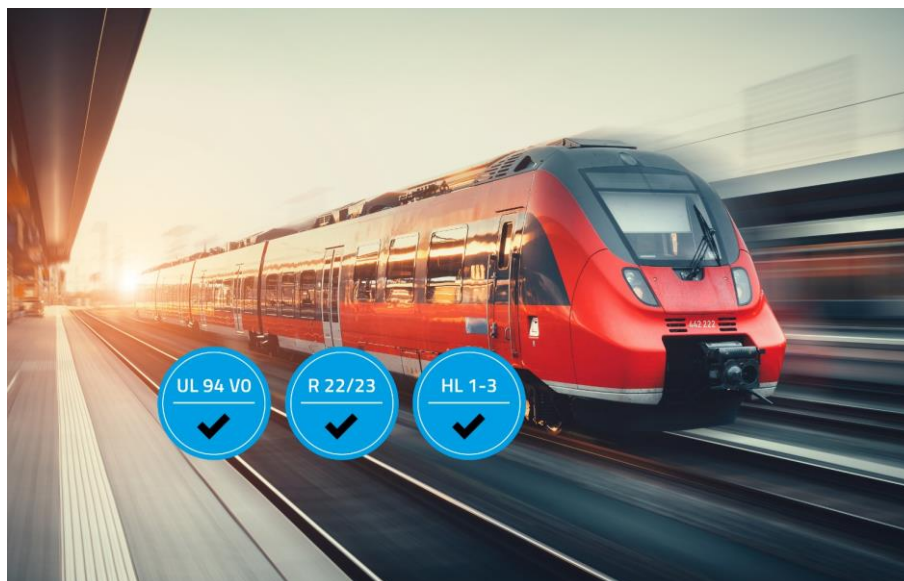
Appendix 3.