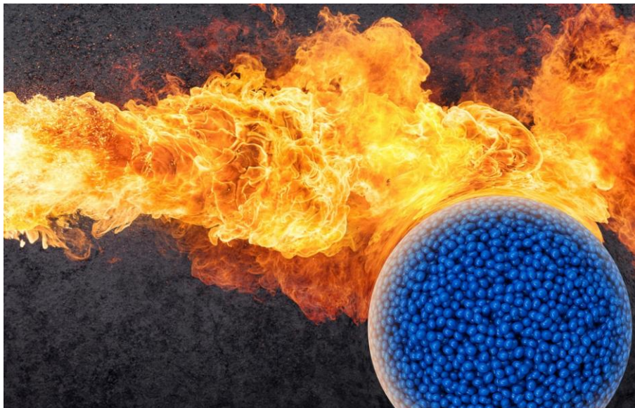
Appendix 5.